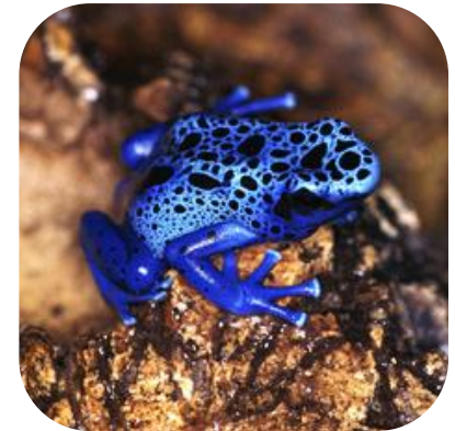
blue poison dart frog