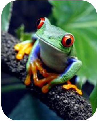
red eyed tree frog